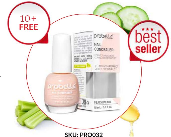
SKU: PRO032 PEACH PEARL 0.5 FL OZ | 15 ML Made in USA