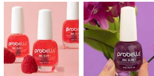
SKU: PRO041 VIOLET 0.5 FL OZ | 15 ML Made in USA