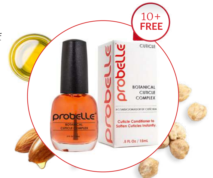
SKU: PRO04 0.5 FL OZ | 15 ML Made in USA

Apply around cuticle area on fingernails & toes as needed. Can be used daily. For home & professional manicures.