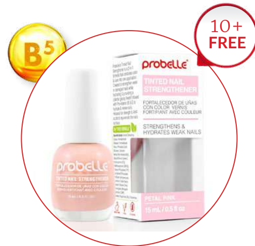
SKU: PRO020 PETAL PINK 0.5 FL OZ | 15 ML Made in USA

If wearing Tinted Nail Strengthener alone without nail color on top, apply 2 even coats to clean, dry nails with cuticles pushed back. Reapply one coat every other day & remove weekly with any polish remover.