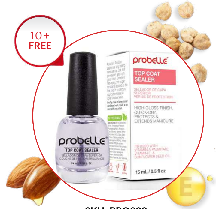
SKU: PRO008 0.5 FL OZ | 15 ML Made in USA