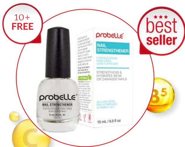
SKU: PRO003 0.5 FL OZ | 15 ML Made in USA