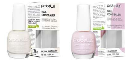
SKU: PRO030 MOONLIGHT GLOW 0.5 FL OZ | 15 ML Made in USA