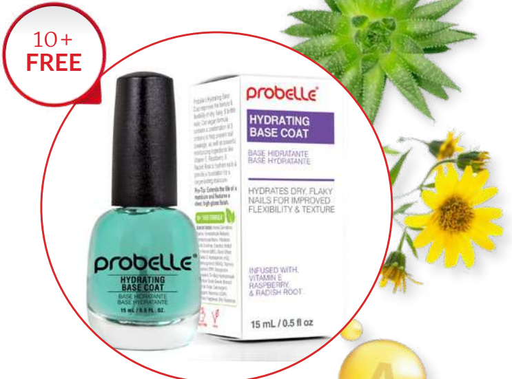
SKU: PRO007 0.5 FL OZ | 15 ML Made in USA

Apply 1 or 2 coats to reach the desired finish. Recommended for use with every manicure.