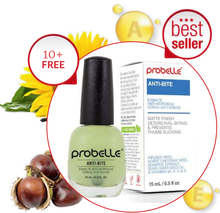
SKU: PRO005 0.5 FL OZ | 15 ML Made in USA